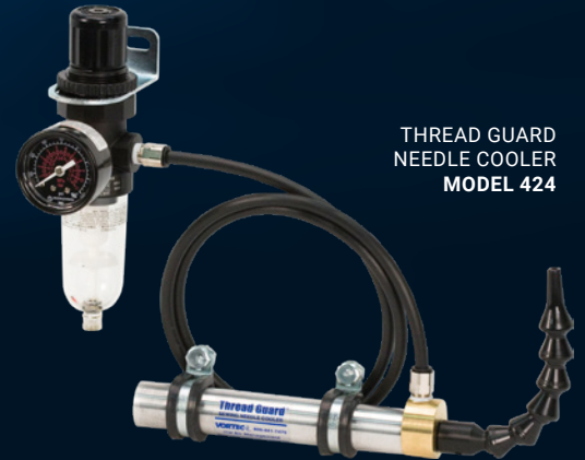
THREAD GUARD NEEDLE COOLER MODEL 424

The air stream is especially effective on difficult sewing surfaces such as belt loops and waist bands; or on tough materials like denim or canvas. Cold air temperature and flow rate are preset to 10°F and 4 SCFM.