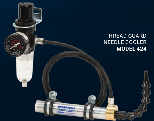
THREAD GUARD NEEDLE COOLER MODEL 424

The air stream is especially effective on difficult sewing surfaces such as belt loops and waist bands; or on tough materials like denim or canvas. Cold air temperature and flow rate are preset to 10°F and 4 SCFM.