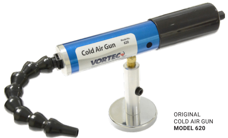
ORIGINAL COLD AIR GUN MODEL 620

The effective cooling from a Cold Air Gun can eliminate heat-related parts growth while improving parts tolerance and surface finish quality.