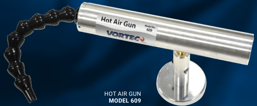
HOT AIR GUN MODEL 609

Hot Air Guns are used where milder heat is needed as compared to an electric heat gun. It is ideal for pre-heating of parts, processes and solutions, with an output flow rate of 2–8 scfm; and is also widely used for softening adhesives, rubber and vinyl, and accelerating drying. The hot air gun requires no electricity at the target, and uses only filtered compressed air to generate fully adjustable temperatures up to 200°F.