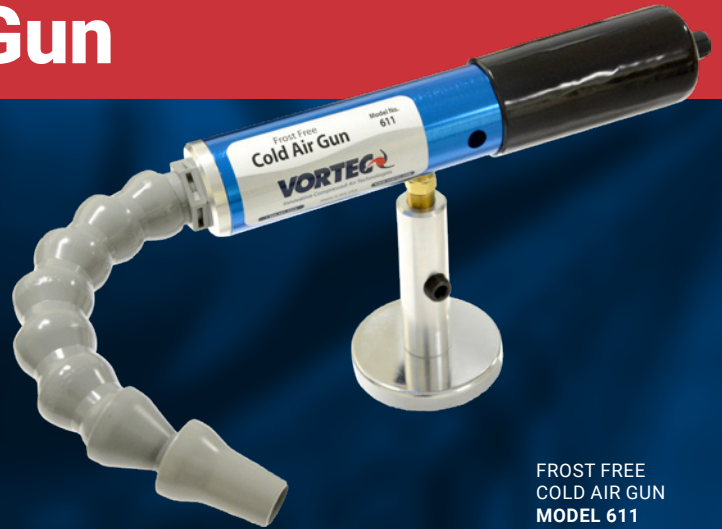
FROST FREE COLD AIR GUN MODEL 611

The Frost Free Cold Air Gun eliminates the mess associated with condensation and frost arising from continuous use of a Cold Air Gun. A must have for sensitive applications such as fabrics, wood, cardboard and paper; as well as standard metalworking applications.