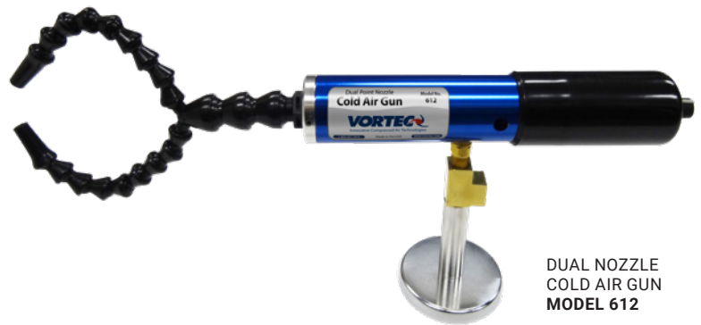
DUAL NOZZLE COLD AIR GUN MODEL 612